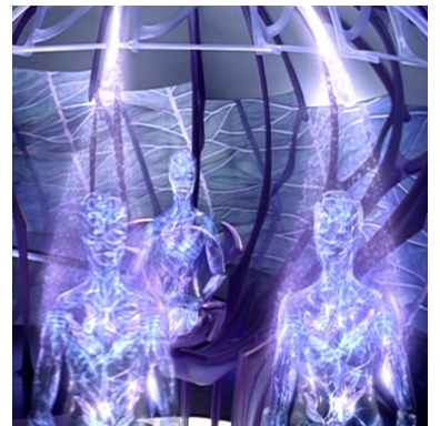
Illustration 1: The Taelon Earth Final Conflict

Back in 1994, Canadian journalist Serge Monast (deceased) wrote an exposé on a secret NASA project known as Blue Beam . These Air Force types do like the blue symbolism, as they deal with the sky. But let's take a look at some older symbolism, first, to see if we spot any other meaning.