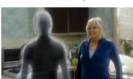
Illustration 3: The Ghost Shift Doctor Who, "Army of Ghosts"

"Seeing is believing," right? If you are making plans to control the spirit of an evolving species, that necessitates being able to create convincing imagery —not just in the sky, but in the minds of those you wish to control. It is not a new theme; it has been used on the BBC series, Doctor Who , a number of times, from the "ghost shift" from the Season 28 episode, "Army of Ghosts," all the way back to the 1968 episode, "The Invasion," where the Cybermen added a "micro monolithic circuit" to the then popular transistor radio that allowed them to take control of human minds, via the "cyber control signal" beamed from space.